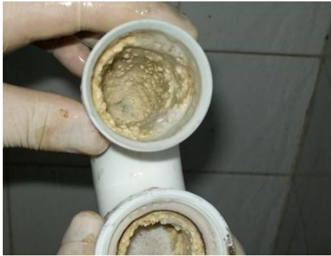
Build up in the pipes

With regular use of the PeePod™ you can prevent these issues from happening as seen in the photos