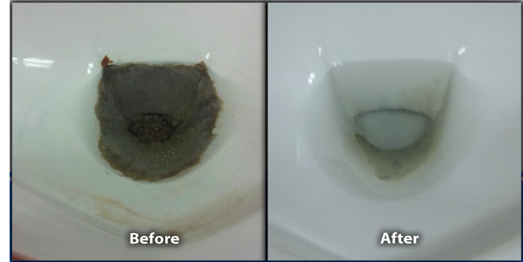
Miami police station PeePod before/after

12 months and 12 PeePod™ changed every 30 days with no scrubbing