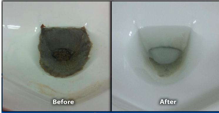
Miami police station PeePod before/after

PeePod™ can remove hard build up of urine salts and also remove stains from urine and minerals in the water